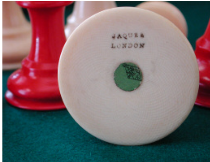
An early registration disc and the Jaques imprint on the base of an ivory set