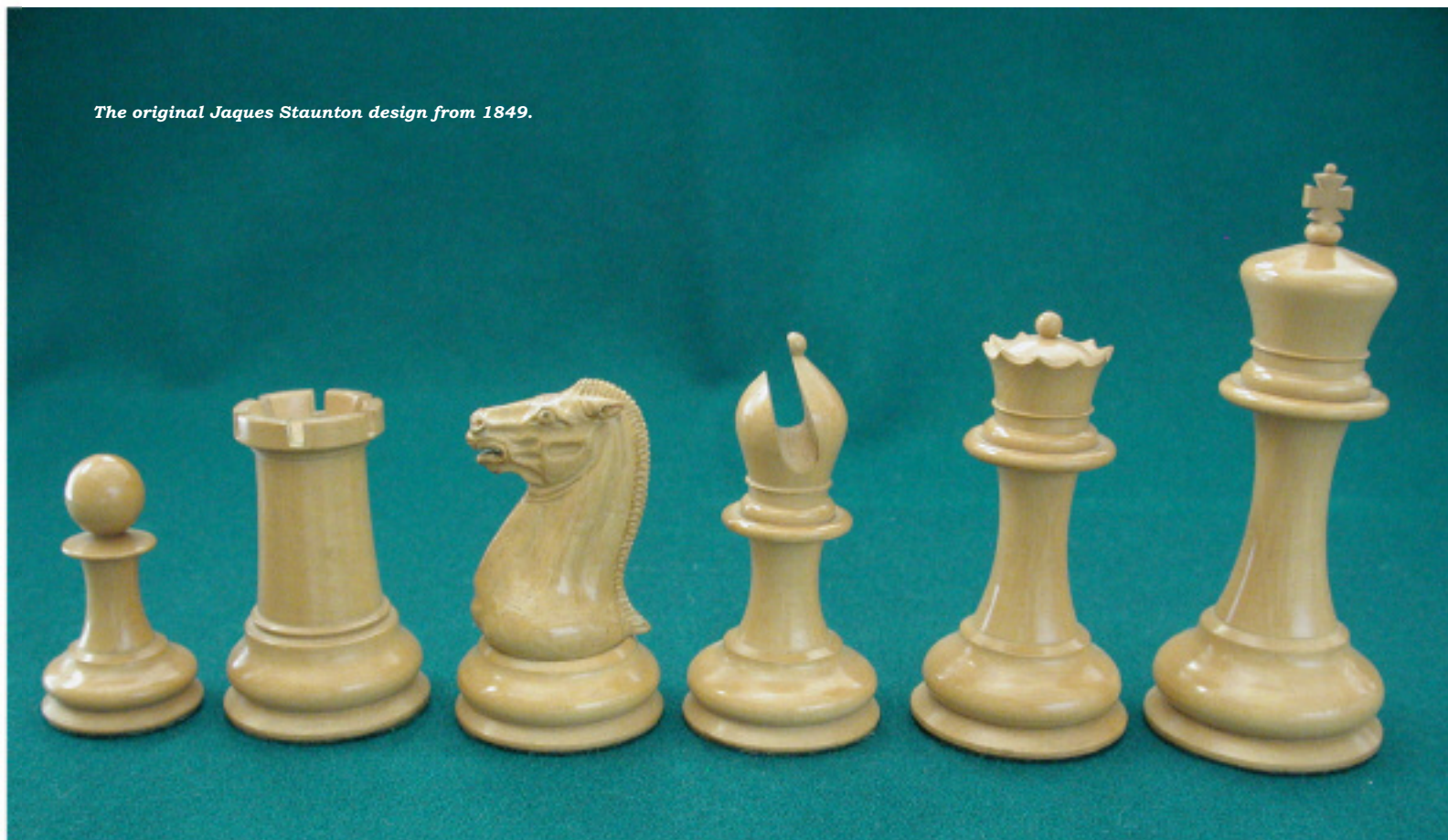
The original Jaques Staunton design from 1849.